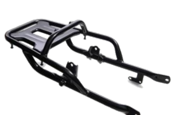
Kit, Rear Carrier 08U70K3RD00