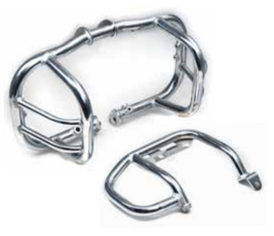
Kit, Engine Pipe 08F70K3RD10 | Chrome 08F70K3RD00 | Mat Black