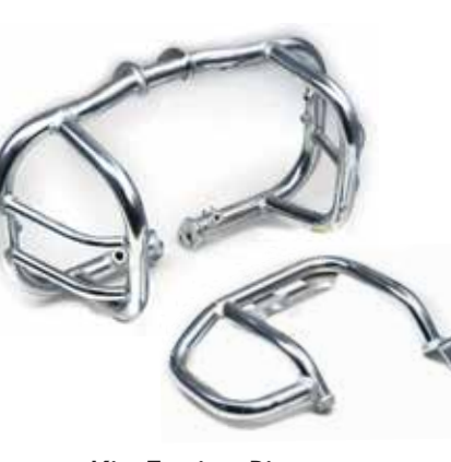
Kit, Engine Pipe 08F70K3RD10 | Chrome 08F70K3RD00 | Mat Black