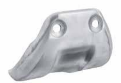
Skid Plate 08F76K0ZD10