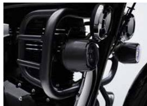
Enhanced Safety with Leg Guard & Fog Lights

Top-notch leg guard offers superior protection and fog lights provide enhanced visibility.