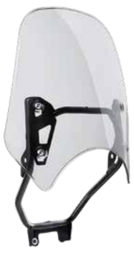
Kit, Long Visor 08R73K3RD00