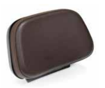
Back Rest 08R76K3RD00ZF | Brown 08R76K3RD00ZE | Black